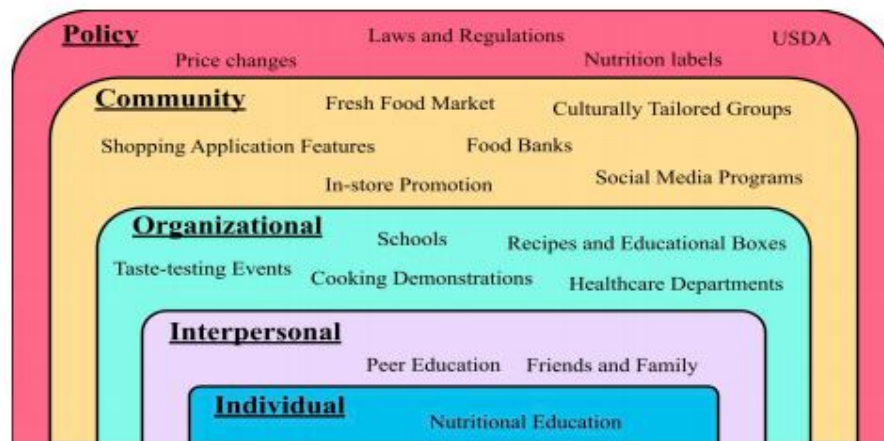
Figure 1: Multilevel approaches to increase healthy food consumption in low-income populations, based on the SEM [2]

family, friends, and social networks[2]. Other more impactful resources that might help this population include those through schools or workplaces, communities considering cultural values and norms, and policy changes from local laws to national changes.