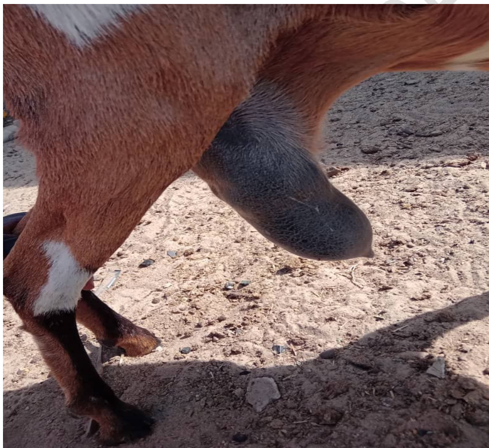
Figure 1: unilateral right uddermastitis at the point of presentation to the clinic

The case presented describes the case of a 2 year old Sahel goat which presented unilateral sub-clinical mastitis infection (figure 1). The case was brought to the large animal clinic of the Veterinary Teaching Hospital, University of Maiduguri, Nigeria. The doe kidded about a month before the presentation of the case. The goat was managed semi intensively with other animals including sheep (3), ram (1), and other goats (4 does and 2 bucks.). The farmer feeds the animals with maize bran, groundnut hay and left over from the kitchen and farm byproducts. The farm has had history of previous Mastitis in goat. The animals had no history of vaccination and previous medication in the farm.