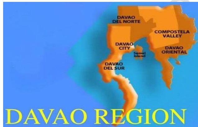
Figure 2. Map of the Philippines highlighting Davao Region