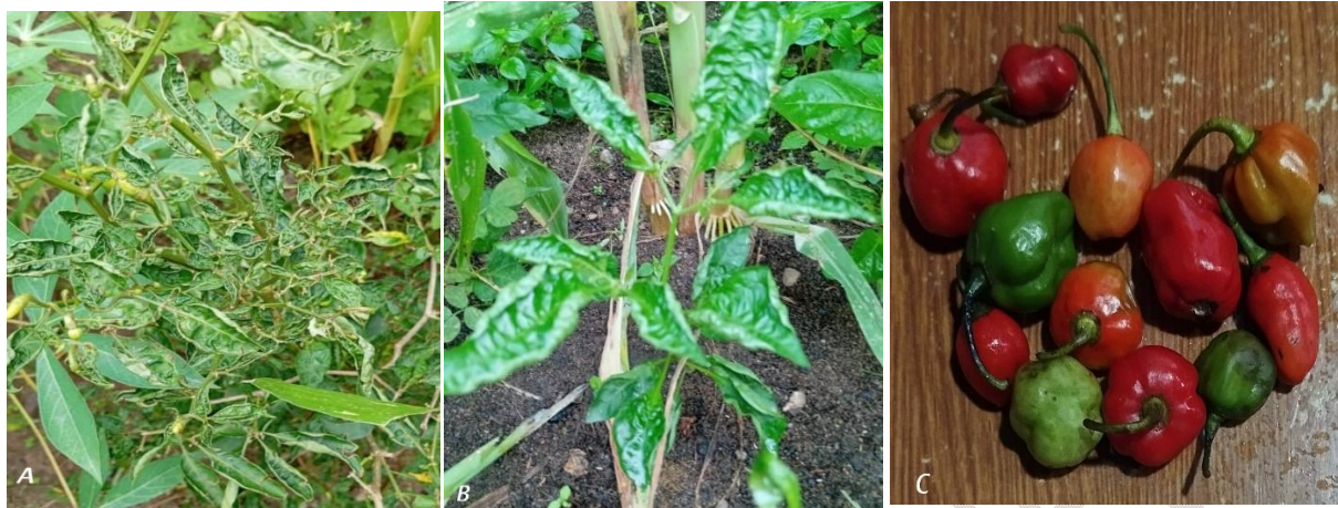
Figure 1: Symptoms of diseased peppers observed in this study. (A) severe symptom and mosaic on stunted plant; (B) Leaf curling on leaves; (C) Normal fruits of Capsicum annuum .

Table 1 shows the results on virus incidence and severity index of some communities in Yala and Ogoja local government areas. The mean percentage incidence of the virus in Okpoma, Bansara and Yache all in Yala was 44%, 40% and 90% while severity was 2.8, 2.6 and 4.6 respectively. The average disease incidence of the virus at Yala was 58% while severity was 3.3. Furthermore, the mean percentage incidence of the virus in Mbube, Ishibori and Ugaga all in Ogoja was 68%, 60% and 54% while severity was 3.6, 3.2 and 3.0 respectively. The average disease incidence of the virus at Ogoja was 60.66% while severity was 3.26 (Table 1). The highest disease incidence was recorded in Yache (90 %) while the lowest was in Bansara(40 %) both in Yala local government area. The average disease incidence revealed a slightly higher incidence in Ogoja (60.66 %) as against 58 % as in Yala. Furthermore, the highest severity was obtained in Yache (4.6) while the lowest of 2.6 occurred in Bansara (Table 1).