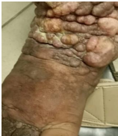
Fig 7 :multiple hyperpigmented coalescing nodules

This was a 48-year-old female civil servant diagnosed with RVD but defaulted to HAART and presented with multiple hyperpigmented coalescing nodules in the lower limbs. A diagnosis of Kaposi sarcoma was confirmed histologically. Unfortunately, she could not commence treatment due to inability to provide medications from severe financial constraints.