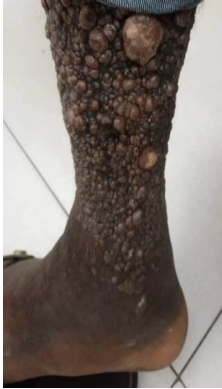
Fig 4 :Post treatment

Histology showed a malignant vascular proliferation within the dermis with lesions consisting of spindle shaped cells. He was treated as a case of K.S and was commenced on IV Doxorubicin. After three sessions of treatment there was an acknowledgeable improvement in his mobility as well as reduction in size of the Kaposi's sarcoma nodules.