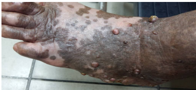
Fig 2 :Suspected classic K.S

Comment [ak8]: Has the treatment been switched from cyclosporine to IV Doxorubicin? Explain that.