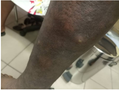
Fig 1 :Post-transplant K.S Case 2: -- (Suspected classic K.S)

The second case is an 84-year-old retired fisherwoman who presented with tender nodules in both legs with background exfoliative dermatitis. Histology showed spindle cells and a diagnosis of K.S was entertained. She was treated with IV Doxorubicin monthly for two years with regression of the lesion. However, she declined further treatment when she developed cough and was diagnosed radiologically of tuberculosis.