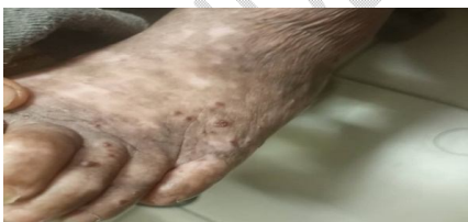
Fig 3 :Pre-treatment