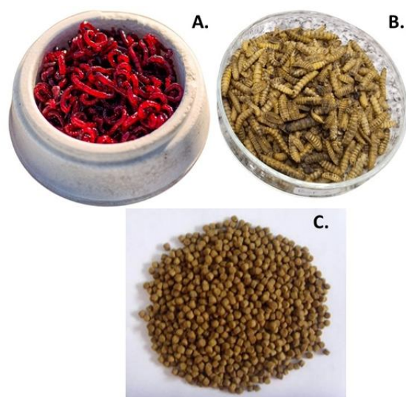
Fig. 1. A) Bloodworm larvae (Chironomidae), B) Black Soldier Fly larvae ( Hermetia illucens ), and C) Commercial pellet