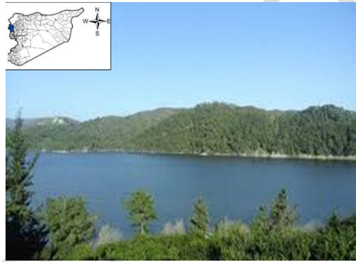
Fig.1: Study location at Lake Balloran Dam.

Lake Balloran Dam is located in the northwestern part of Syria, near the village of Balloran, to the right of the Latakia-Kassab road, approximately 30 km north of Latakia (35°49'29"N, 35°57'6"E). The dam was built in the valley of the Shamerliya River. A total of 68 fish specimens were collected monthly from various sites around the lake between July 20, 2020, and August 15, 2021 (Figure 1). The fish were captured using gill nets, cast nets, and standard hand fishing rods. The samples were taken to the Graduate Research Laboratory in the Department of Animal Biology, Faculty of Science, where they were identified to the species level using international taxonomic keys [13, 14, 15, 16].