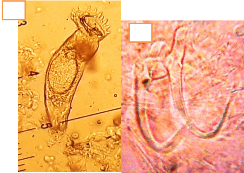
Fig. 5: (A) General appearance of G. elegans ( \times 10 ); (B) Central hooks with connecting piece ( \times 40 )