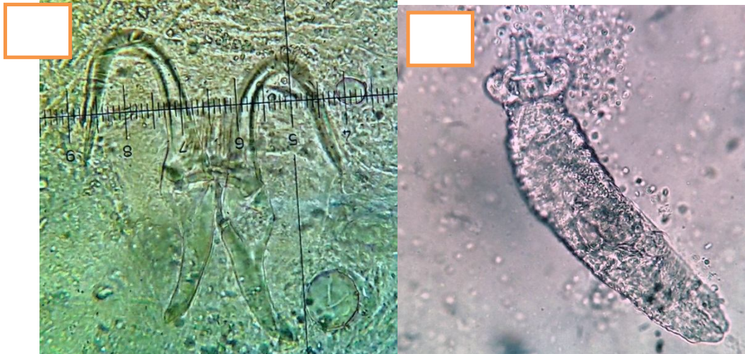
Fig.3:(A) General appearance of D. minutus (×10); (B) Central hooks with connecting piece (×40).