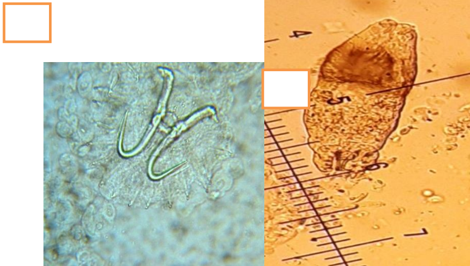
Fig. 6: (A) General appearance of G. derjavini (×10); (B) Peripheral hooks and central hooks with the connecting piece.(40×)