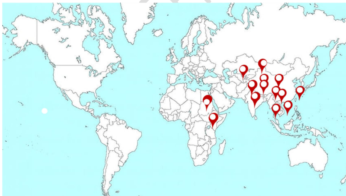
Fig.1- Distribution of wood apple in world.

South India, Sri Lanka, Nepal Bangladesh Pakistan, Indo-China, Philippine Islands to West Africa, Northern Malaysia, Indonesia and Western Himalaya regions