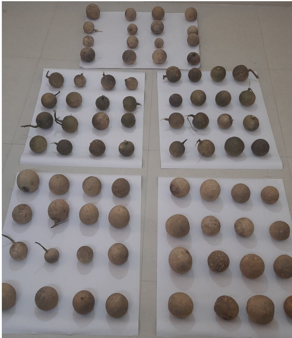
Fig.3- Variability in fruits of wood apple.