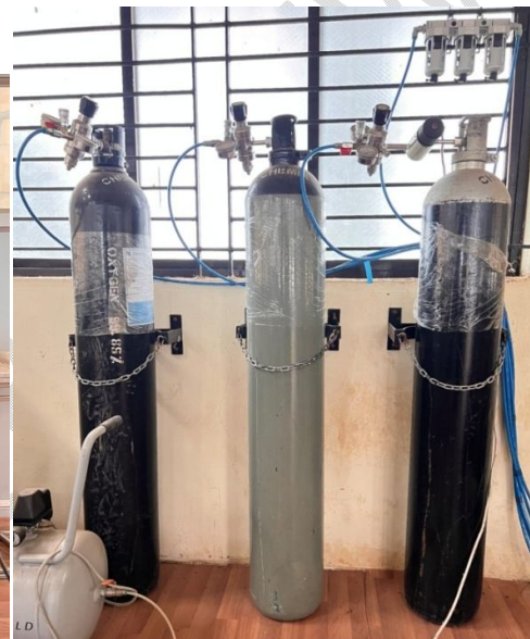
b. CO 2 , O 2 , N 2 gas cylinders