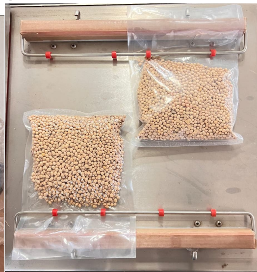
d. Sealing chamber