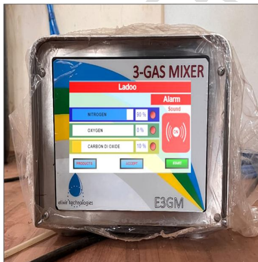
c. Gas mixing chamber