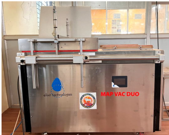
a. MAP VAC DUO machine