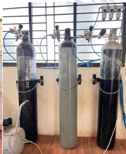
b. CO 2 , O 2 , N 2 gas cylinders