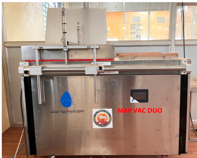
a. MAP VAC DUO machine