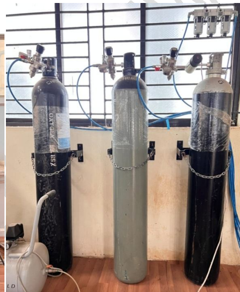
b. CO 2 , O 2 , N 2 gas cylinders