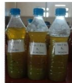
NA -7 (RTS)