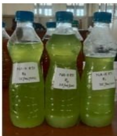
NA -5 (RTS)