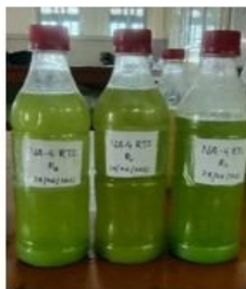
NA -4 (RTS)