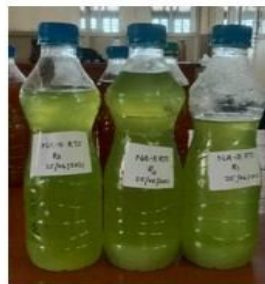
NA -10 (RTS)