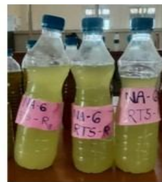
NA -6 (RTS)