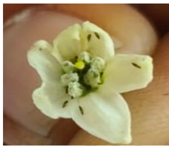
Fig.2. Thrips parvispinus collected from chilliflowers