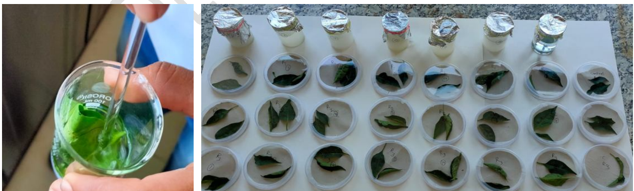
Fig.3. Laboratory bio assay studies on efficacy of insecticides against Thrips parvispinus