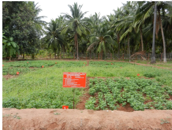
Fig. 1. Overall view of the Experimental Site

The crop was harvested manually after attaining the physiological maturity (110 days). Harvested nuts were dried to 12% moisture, and weighed. Shelling percentage was calculated by dividing seed weight by pod weight. Kernel yield was calculated as the multiple of pod yield and shelling percentage. Harvest Index was computed as the ratio of economic yield and biological yield. Data was analysed statistically employing Panse and Sukhatme, 1985.