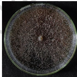
Fig. 3. Pure culture of Rhizoctonia solani

The mycelia was formed in different colours ranging from white, cream to dark brown. The growth pattern was flat along with the production of aerial mycelia. The sclerotia was produced within 2-3 days. It was white in the beginning and then became light brown to dark brown after maturation (Fig. 3.). Many of the research findings have recorded that the mycelial colour of Rhizoctonia solani varied from white to dark brown depending on the isolate [14].