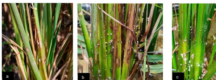
Fig. 1. Symptoms of sheath blight disease in rice. a - Water-soaked lesions on sheaths; b - White sclerotia on the sheath; c - White mycelia on the surface of the plant