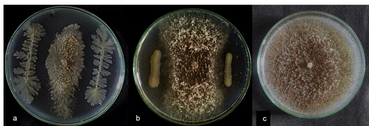
Fig. 4. In vitro evaluation of bacterial biocontrol agents against sheath blight pathogen by dual culture

a - Rhizoctonia solani against Bacillus amyloliquefaciens ; b - Rhizoctonia solani against Pseudomonas fluorescens ; c - Control