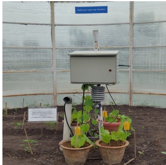
Fig. 1a Elevated CO 2 & temperature levels