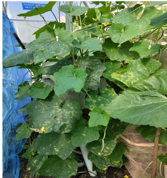
Fig. 1b Elevated CO 2 at 550±25 ppm with normal temperature