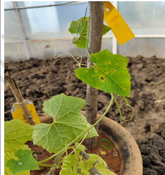
Fig. 1c Ambient CO 2 at 410±25 ppm with 2 °C rise in temperature