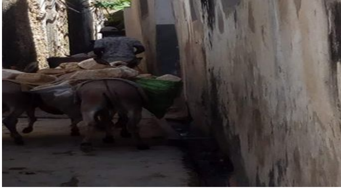
Picture 4 :Lamu old town trader carrying good with the help of a donkey.

Manifestation of authentic, well maintained cultural heritage was more evident in lamu than in The old town of Mombasa. This may be due to Lamu having a unique status as a UNESCO heritage site, thereby giving it more priority in heritage conservation and management.