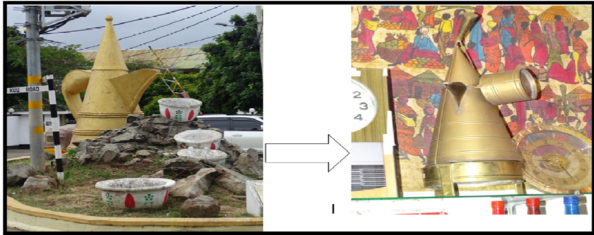
Plate 1 Replica of Coffee pot used by ancient Swahili people

serve guests with coffee. The coffee pot was known as Buli and it is used as an element with historical bearing indicating an interesting aspect of cuisine. The Bronze Kettle was popularly used as it could keep the coffee hot for a long period. The pot was later built-in front of fort Jesus in 1988.