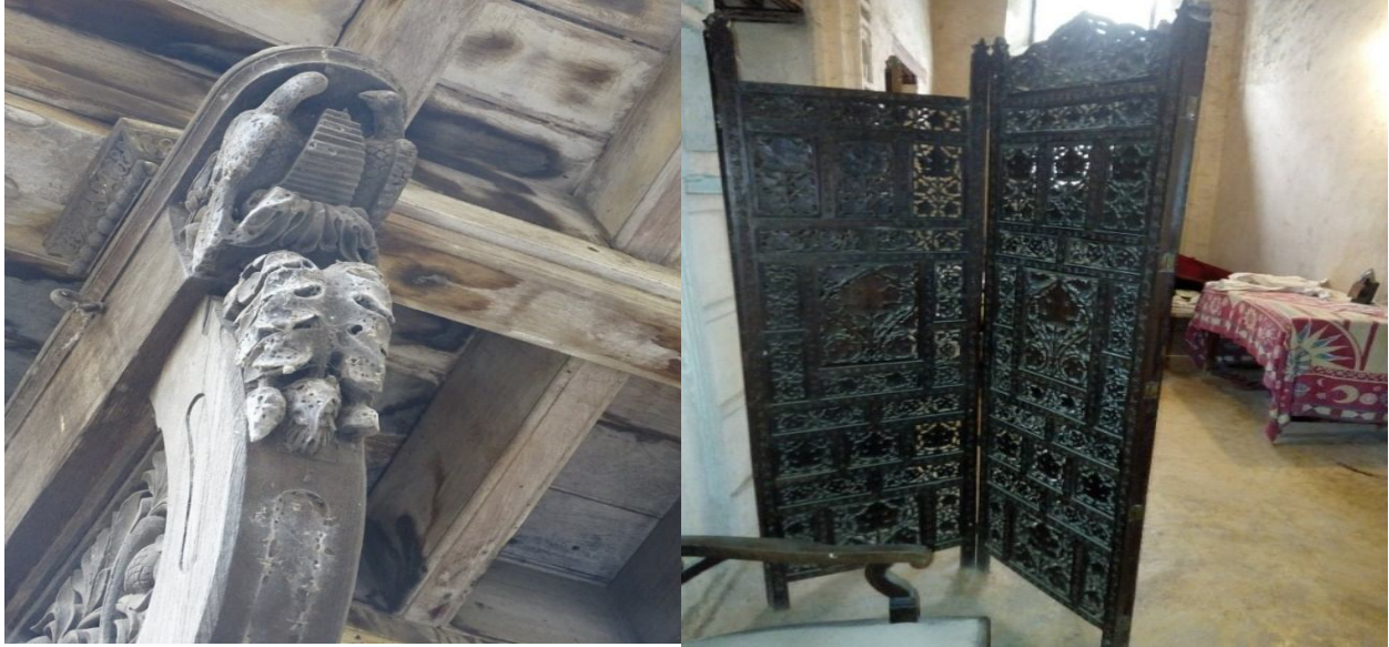
A cultural artefact used as a room divider (the divider has an Arabic/Indian/Swahili heritage and may come in sizes, designs, aesthetics that will represent the heritage of the household occupants.