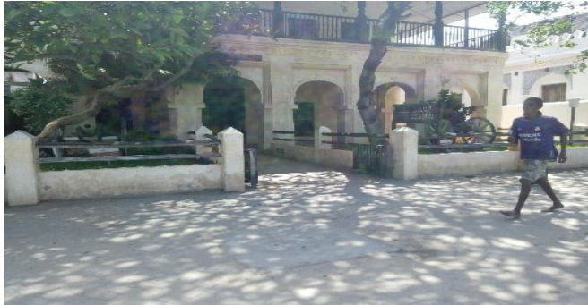
Plate 3A The front sections of Lamu Museum

the official residence of the Senior British Colonial Administrator. In post-independence Kenya the building served as the District Commissioners residence until 1968.