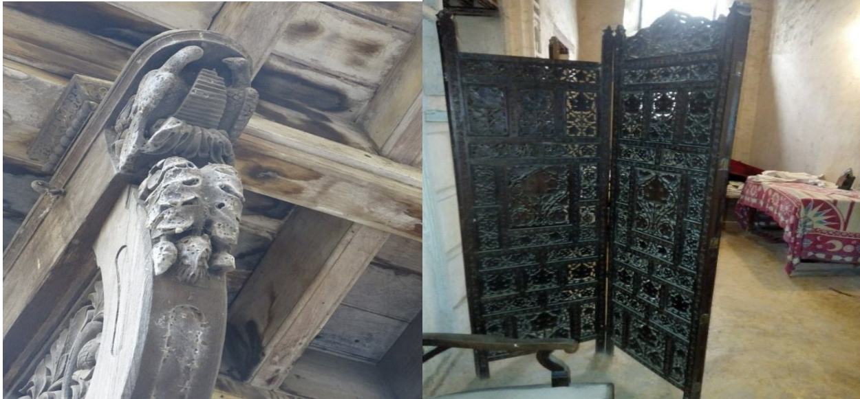
A cultural artefact used as a room divider (the divider has an Arabic/Indian/Swahili heritage and may come in sizes, designs, aesthetics that will represent the heritage of the household occupants.