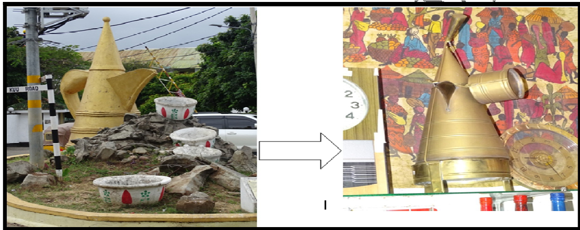
Plate 1 Replica of Coffee pot used by ancient Swahili people

Tangible heritage on the other hand seems to be more prominent and well identified by the locals. There are replicas of objects which represent cultural heritage of the old towns. For example, plate 1 indicates a replica of the ancient coffee pot, which was symbolic of all Swahili people and was used to serve distinguishes guests with coffee. It had 24 cups which were used to serve guests with coffee. The coffee pot was known as Buli and it is used as an element with historical bearing indicating an interesting aspect of cuisine. The Bronze Kettle was popularly used as it could keep the coffee hot for a long period. The pot was later built-in front of fort Jesus in 1988.