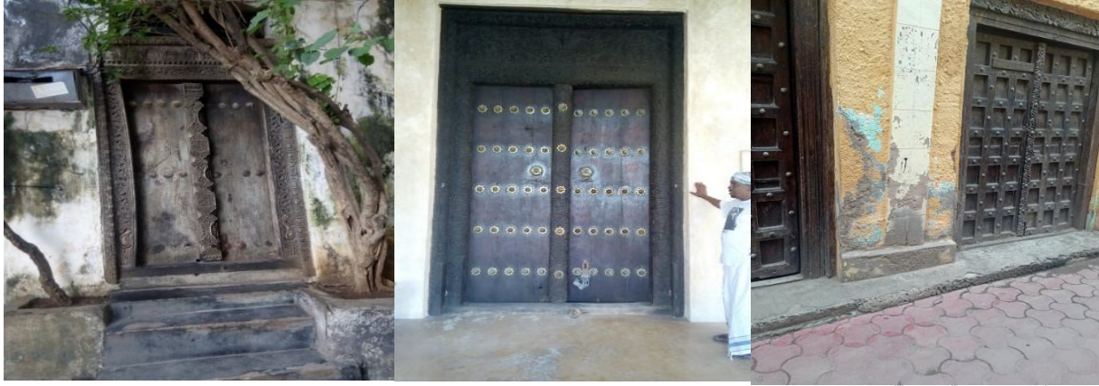
Figure 3 and 4: Swahili door in Shanga (Lamu) and Old town of Mombasa

Known as the Swahili doors, these doors represent a mixed heritage of the Persian- Shiraz, Oman, and Indian Heritage. The doors have either a rectangular frame and more recent one which have an arched shaped frame. The manifestation of well-preserved doors in all the famous houses found in the two old towns shows the significance of doors and portrays earlier trading commodities and resources eg wood. The size and decorations on Swahili doors represented the social status of house occupants. The larger and more ornamented the door was, the greater the social status or wealth. Even now, most doors are divided into half. Traditionally, the left door was known as the female door and the right door was known as the male door.