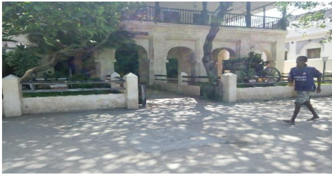
Plate 3A The front sections of Lamu Museum