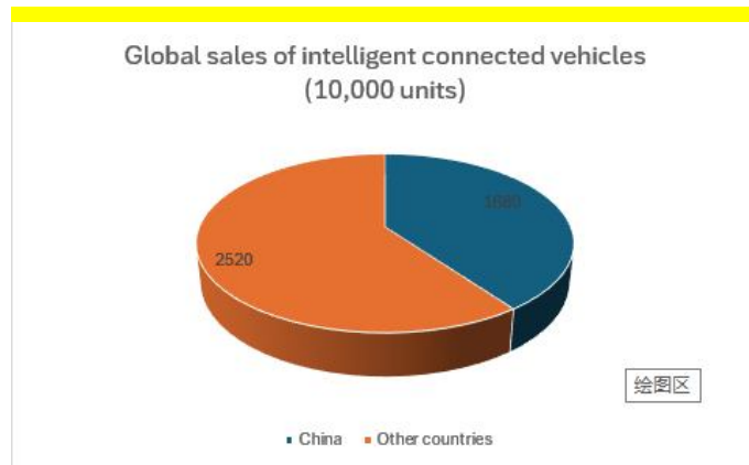
Figure 1 The Global sales of intelligent connected cars

The problem of information security is an important risk point faced by intelligent connected vehicles. With the rapid development of intelligent connected vehicles, it has attracted more and more attention. In fact, the security threats faced by intelligent connected vehicles are no longer limited to points and surfaces. Problems in any link can lead to attacks and even physical damage to the car [5] . Therefore, it is particularly important to ensure the information security of intelligent connected vehicles.