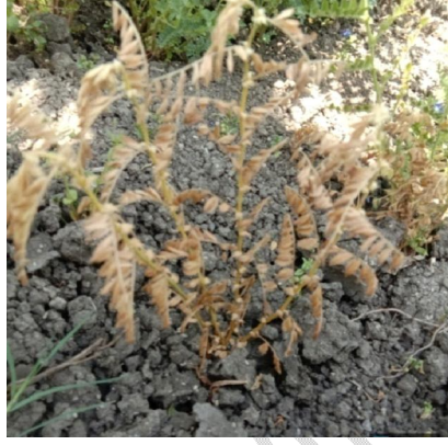
S. Collar rot symptoms on aerial parts of plant in field