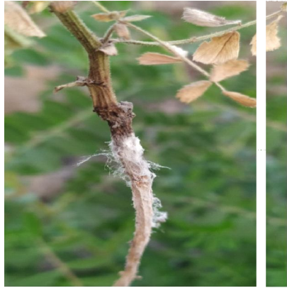
White mycelium strands of rolfsii on root system