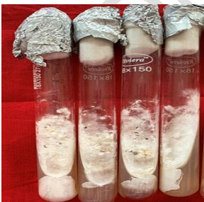
Pure culture slants