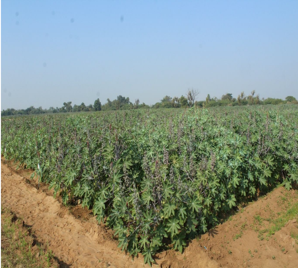
Fig.2 General overview of experimental field of castor