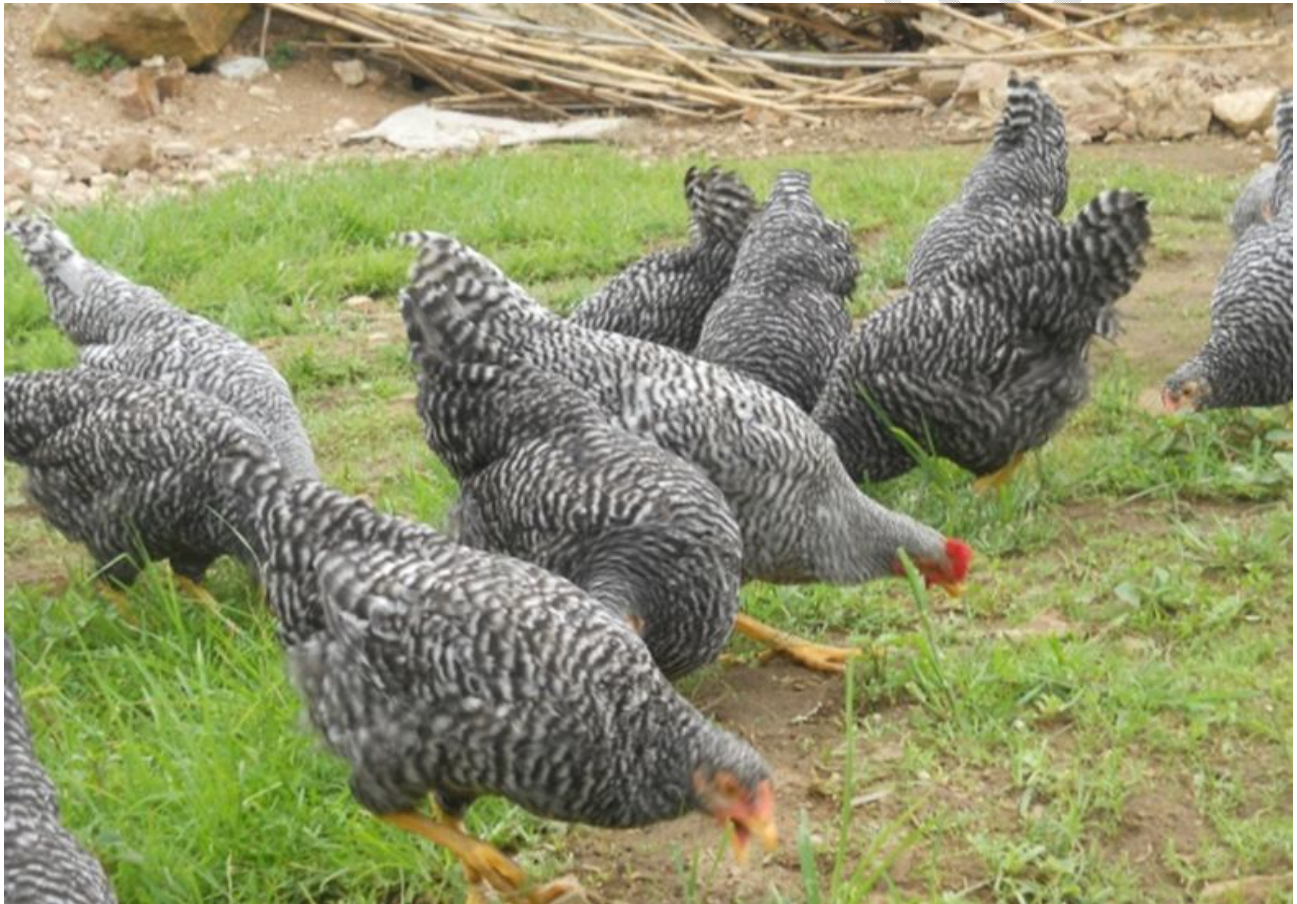
Fig. 2: Physical performance of Koekoek chickens under the farmers' management

The data were collected and analyzed using methods of descriptive statistical methods (mean, minimum, maximum and standard deviation) and five scales Likert scale analysis using tools of SPSS. The Likert scales assigned from 1-5, namely strongly Disagree up to Strongly Agree used to analyze the data. Simple descriptive statistics for the egg mean yield and mean score of agreement level and percentage for frequency perception measurement attribute parameters.