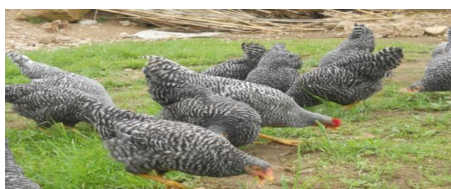
Fig. 2: Physical performance of Koekoek chickens under the farmers' management

The data was were collected were and analyzed through using methods of descriptive statistical methods (mean, minimum, maximum and standard deviation) and five scales Likert scale analysis using tools of SPSS. The Likert scales assigned from 1-5, namely strongly Disagree up to Strongly Agree used to analyzed the data. Simple descriptive statistics for the egg mean yield and mean score of agreement level and percentage for frequency perception measurement attribute parameters.