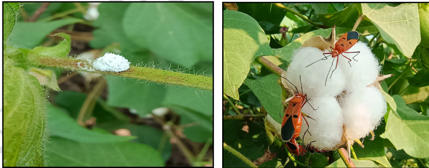
Fig.1 a) Mealybug b) Red cotton bug

The present investigation was conducted during the Kharif season of 2023-24 at the Main Cotton Research Station, Navsari Agricultural University, Surat, Gujarat by using four Bt cotton hybrids i.e. , ATM BG II, Ajeet 155 BG II, RCH 2 BG II and G. Cot. Hy.10 BG II. The populations of mealy bugs and red cotton bugs were recorded at fortnight interval on five randomly selected plants with four replications, both under protected conditions and in unprotected environments. This study aimed to assess the differences in pest populations between these two conditions. The protected plants received pest control measures, while the unprotected plants were exposed to natural pest pressures without any intervention. By comparing the population dynamics of these pests in both scenarios, we can gain insights into the effectiveness of protection strategies and the impact of pest pressure on cotton plants from 120 to 195 DAS.