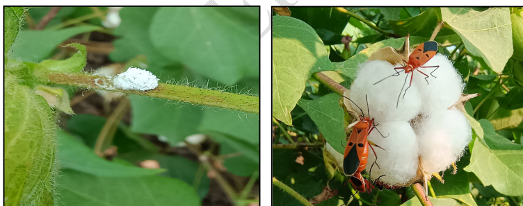
Fig.1 a) Mealybug b) Red cotton bug

Comment [A6]: Mention the time duration of observations taken