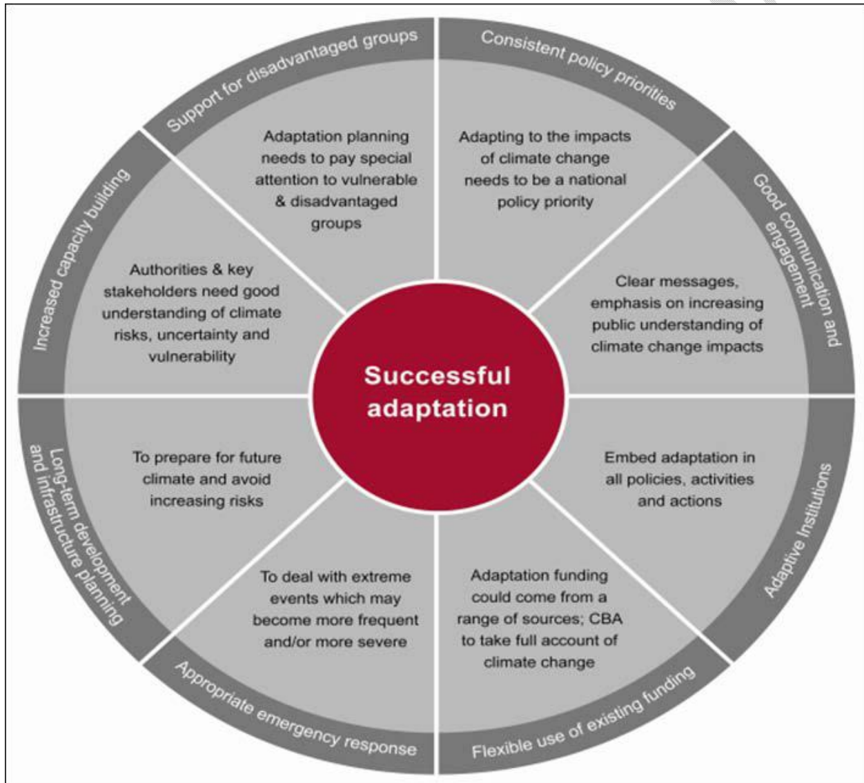
Figure 2: Adaptation framework