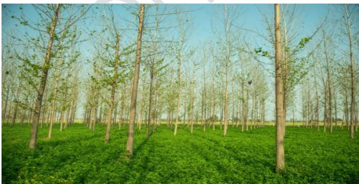
Fig 1: Agroforestry significance in combating climate change