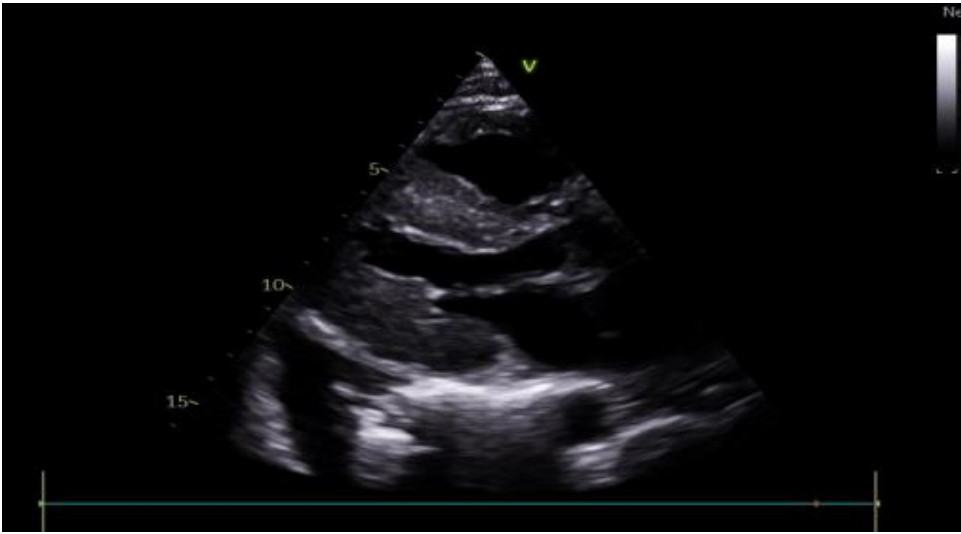
Fig. 2. Parasternal long-axis view on echocardiography demonstrates diffuse concentric left ventricular hypertrophy