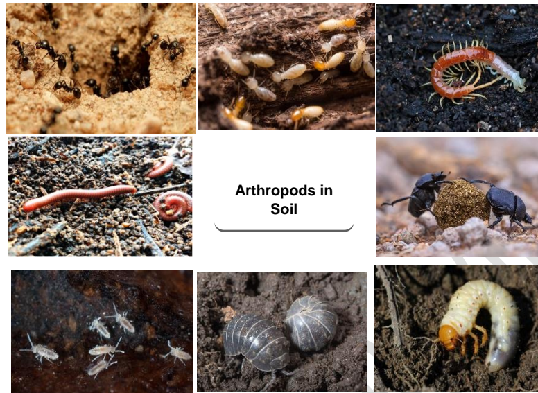
Fig. 2 Different Arthropods in soil

As arthropods feed and burrow, they provide many benefits to soil health. Moving through the soil, they aerate and gently churn it, improving porosity, water infiltration rates, and bulk density. As they feed, they shred organic matter, speeding decomposition. And when they excrete waste products, they release mineralized plant nutrients and enhance soil aggregation because their waste is coated with mucus. Their feeding also curbs the populations of other soil organisms and opens the way for a wider variety of other, smaller decomposers.