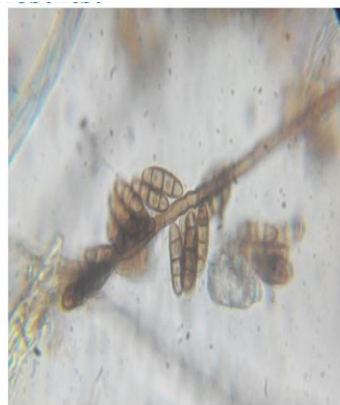
Aquapteridospora bambusinum Bao