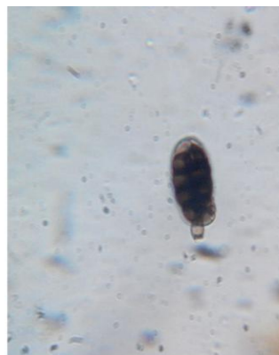
Pseudesiumm chiangmaiense Lu and Hyde