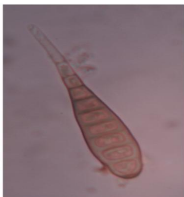
Sporidesmium nujiangense Bao, Su, Hyde and Luo