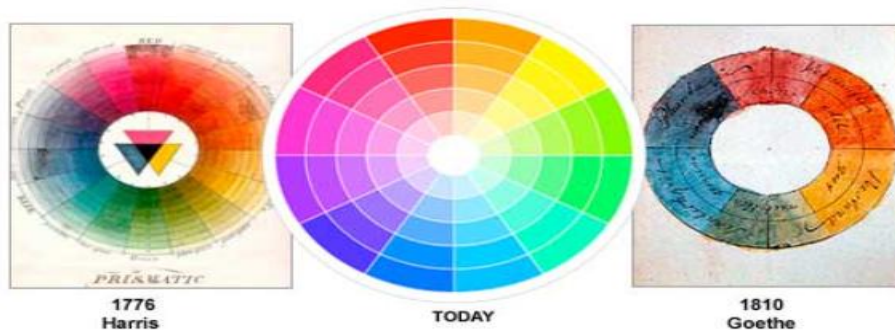
Fig 1. Teaching listening

To solve these problems, the teachers have to focus on the appropriate material. Having good material will lead students to more be motivated and interested in