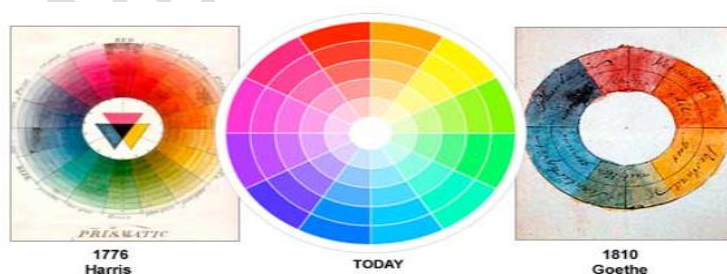
Fig 1. Teaching listening

To solve these problems, the teachers have to focus on the appropriate material. Having good material will lead students to more be motivated and interested in