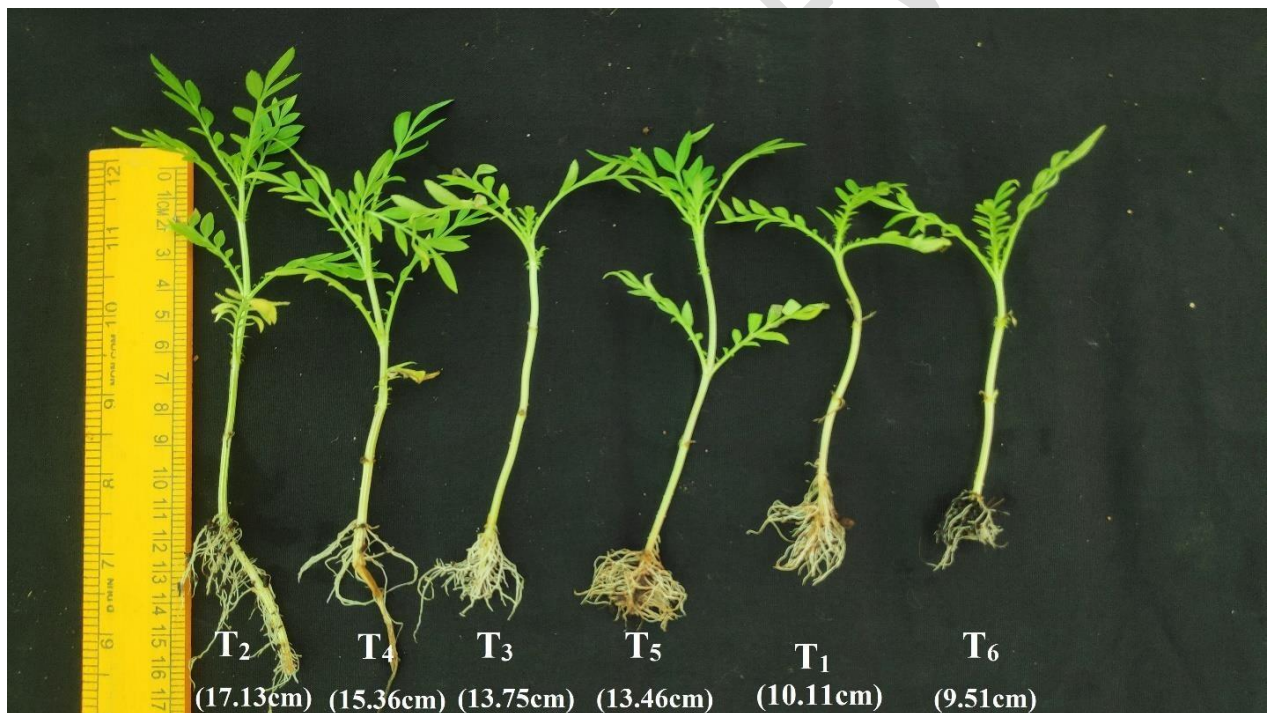
Fig 2. Influence of different media and containers on plant height of Tagetes sp terminal cutting on 30 th day