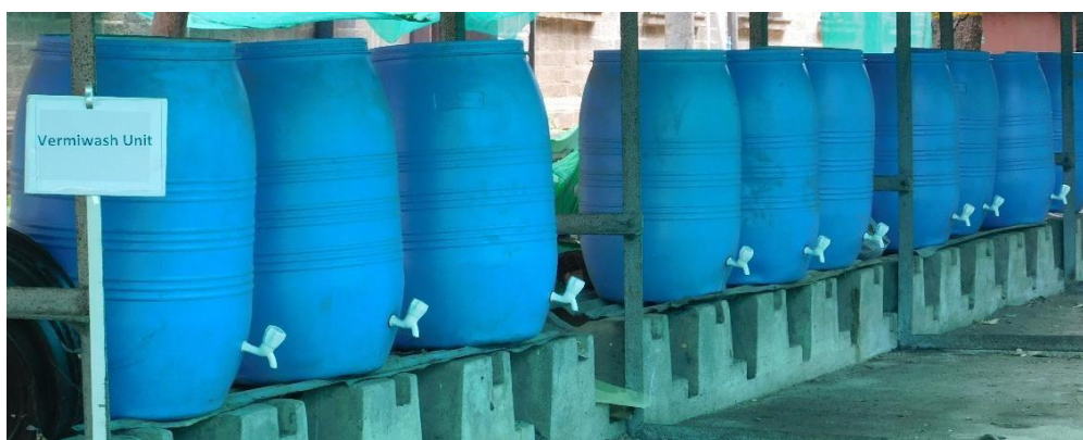
Figure 3 Vermiwash unit with 200 litre plastic drums