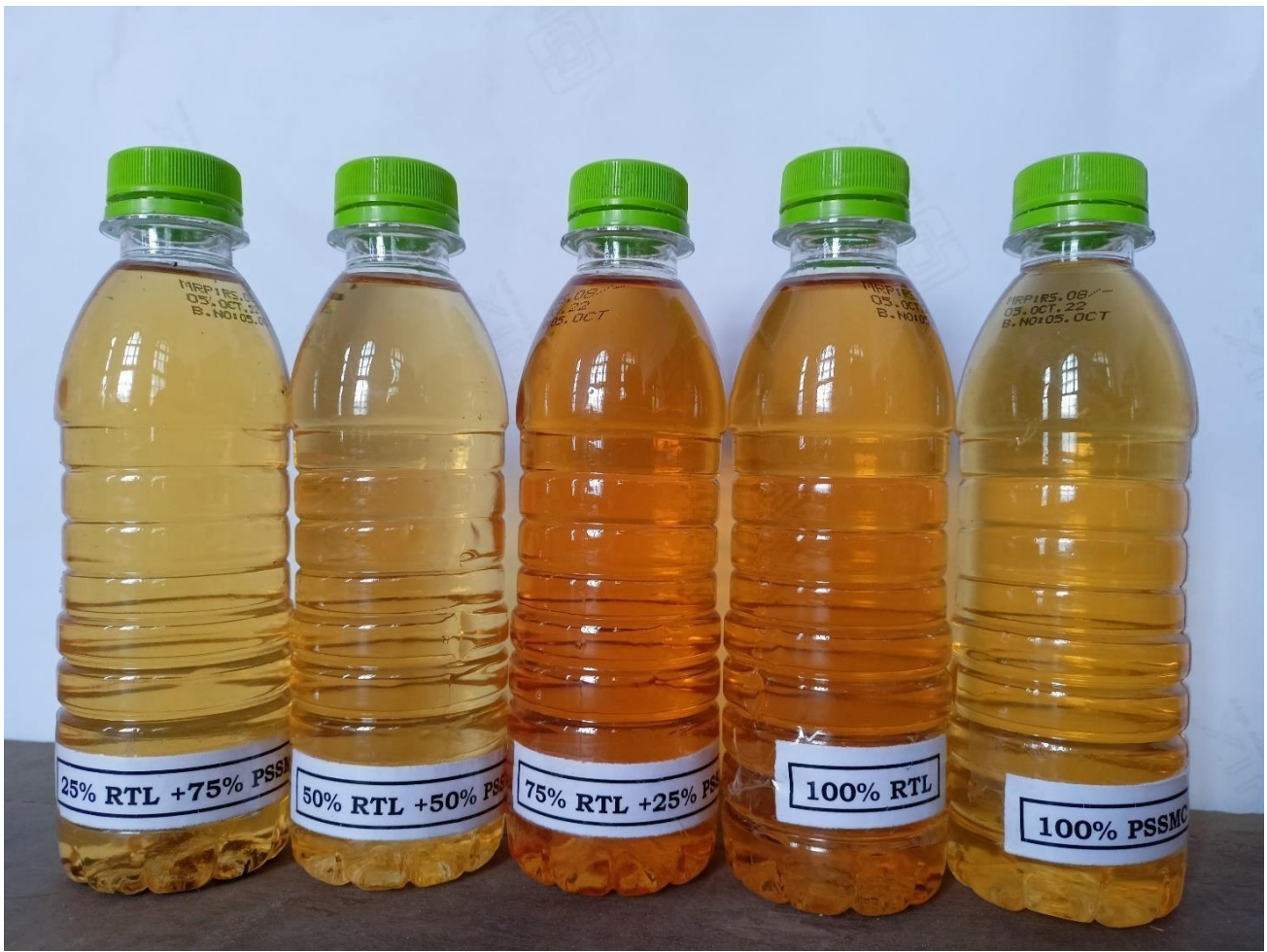
Figure6 Vermivash (first harvest) from different treatments.