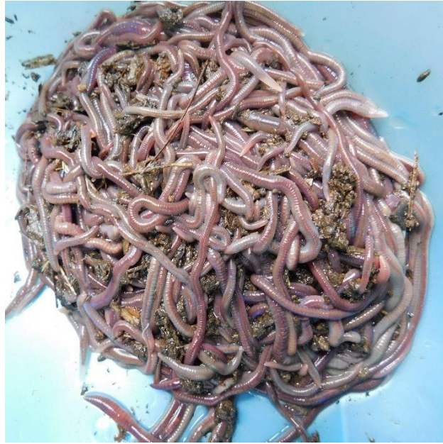
Figure1 Earthwormsofspecies Eiseniafetida