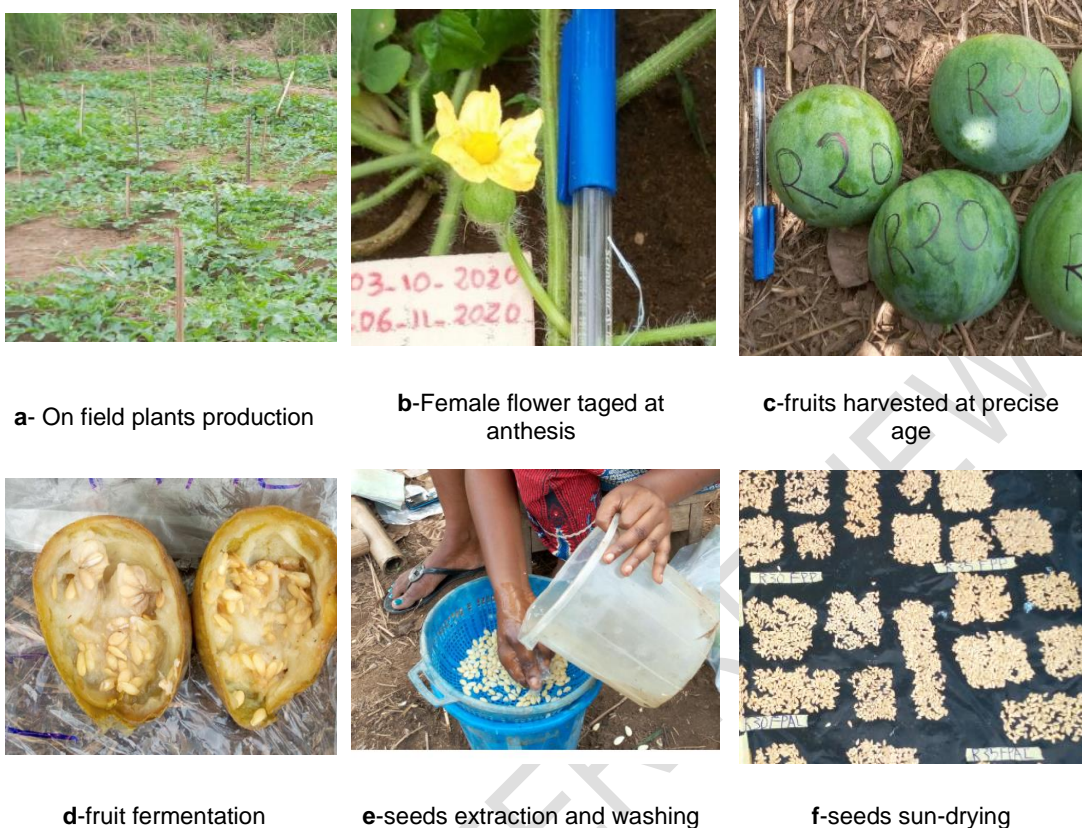
Figure 2. Process of obtaining various aged seed of Citrullus lanatus