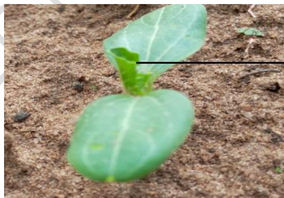
a -Some steps of C. lanatus seeds germination in Petri dish b -Seedling of C. lanatus at emergence step on farm