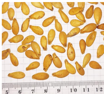
Figure 1. Oilseeds of Citrullus lanatus "wlêwlê" cultivar

In this study, plant material consisted of oilseed from the "wlêwlê" cultivar of Citrullus lanatus .