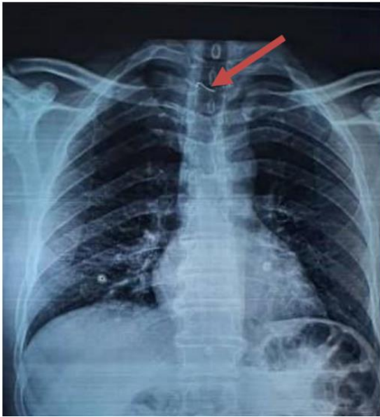
Figure 2: Frontal chest x-ray showing the presence of dentures with metal wire at the upper third of the esophagus.

The unprepared abdominal X-ray showed radio-opaque FBs in 19 patients with variable projections (Figure 3).