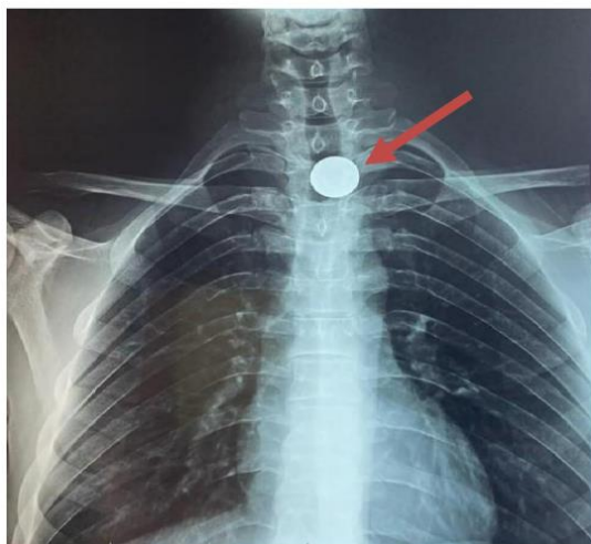
Figure 1: Frontal chest x-ray showing the presence of a coin in the upper third of the esophagus.

The frontal chest X-ray revealed radio-opaque FBs projecting into the oesophagus in 9 patients (Figure 1, 2).