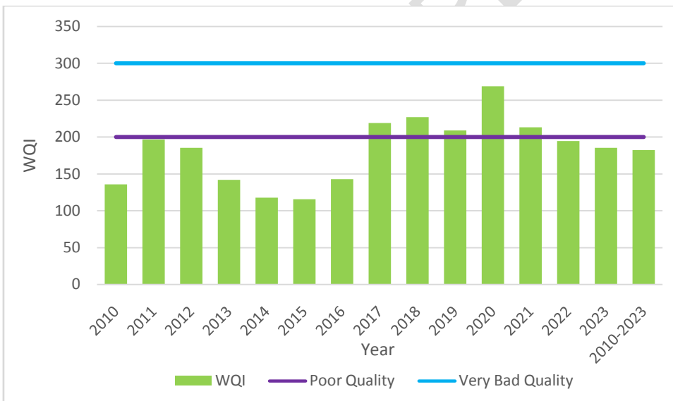
Figure 3 Water Quality Index (WQI) of Lake Chapala by year and over the entire period 2010-2023