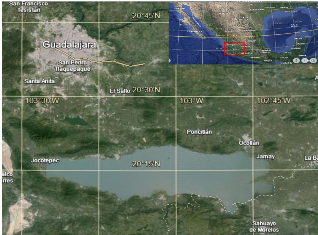
Pic. 1 Lake Chapala Basin

Based on the above, it is of vital importance to evaluate the physicochemical parameters and heavy metals, to determine the quality of the lake's water, the ecological and health risks, to establish whether the quality of the lake's water may be associated with the negative effects on public health of the population that uses its waters as a source of drinking water supply.