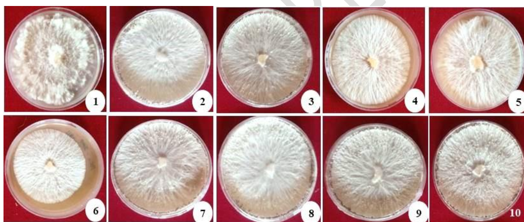
Fig. 1 Mycelial growth of S. rolfsii isolates on PDA media after 7 days