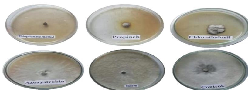
Fig.2 Poisoned food technique with different fungicides and plant extracts.

Comprison with other research studies can provide valuable insights into the effectiveness of the tested fungicides and plant extract against Alternaria alternata a study by Sharma et al. ,(2020) investigated the inhibitory effects of fungicides and plant extracts on Alternaria alternata in vitro. Their findings showed similar trends in fungicidal efficacy, with Thiophanate Methyl 70% WP exhibiting the highest inhibition (100.0%) of mycelial growth, consistent with our study. Additionally, Propineb 70%WP showed significant inhibition (94.45%), aligning with our results. Furthermore, a study by Patel et al. ,(2019) evaluated the efficacy of plant extracts. Their result demonstrated comparable inhibition percentages with Neem extract showing the highest inhibition (19.0%), similar to our findings (18.53%). Garlic extract also exhibited notable inhibition (14.33%), consistent with both studies. However, contrasting results were observed in a study by Singh et al. ,(2018), where Azoxystrobin 23%SC displayed higher inhibition (78.6%) compared to our study (65.54%). This disparity could be attributed to variations in experimental conditions, fungal strains or concentration used. Overall, the effectiveness of Thiophanate Methyl, Propineb, Neem and garlic extracts against