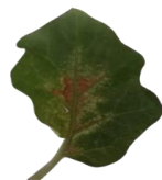
Fig-1. Initial symptoms of Alternaria leaf spot of Brinjal.

This disease manifests as small, dark brown to black spots on leaves, which gradually enlarge and merge, leading to extensive necrosis. As the infection progresses, the spots develop a concentric ring pattern, characteristic of Alternaria spp. The fungus primarily infects older leaves but can spread to younger foliage under conducive condition, such as high humidity and optimum temperatures in severe cases, the leaves may exhibit chlorosis, wilting, and premature defoliation, compromising the plants photosynthetic capacity and overall health.