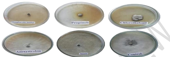
Fig.3 Poisoned food technique with different fungicides and plant extracts