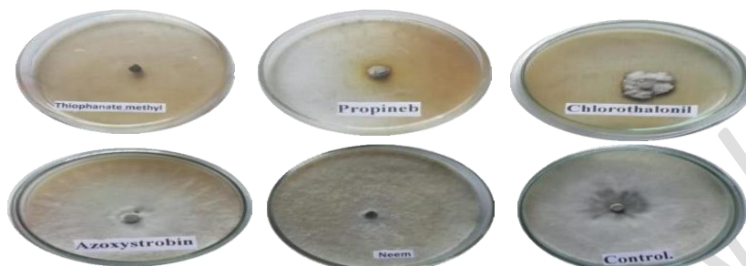
Fig.3 Poisoned food technique with different fungicides and plant extracts