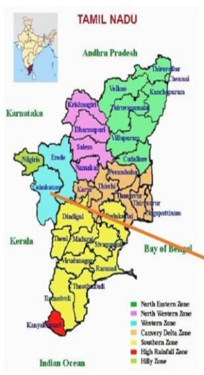
Fig.1 Map showing study location

The pot experiment was conducted at Instructional farm (North), Karunya Institute of Technology and Sciences, Coimbatore. The experimental site is geographically located in the western agro- climatic zone of Tamil Nadu at 10°56'N latitude and 76°44'E longitude at an altitude of 427 m above mean sea level.