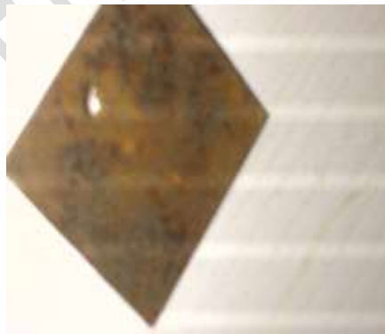
Figure 8 shows the effect of UV on HCl after one week after cleaning.