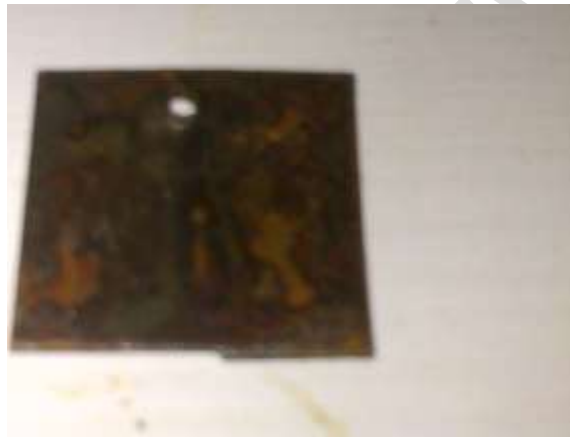
Figure 7 shows the effect of UV on HCl after one week before cleaning