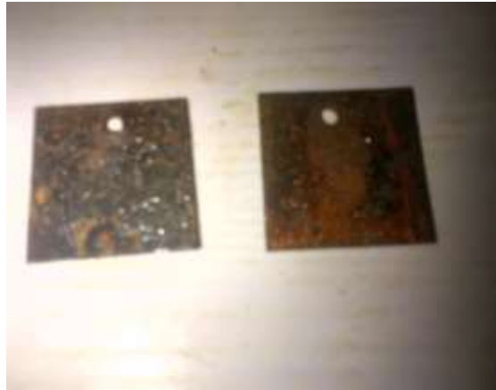
Figure 3 shows the effect of UV on HCl before cleaning