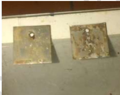
Figure 2. shows the effect of UV on NaCl after cleaning

Figures 3 and 4 shows the effect of UV on HCl before cleaning and after cleaning respectively. The result shows that the UV had an effect on the coupons by reducing the corrosion.