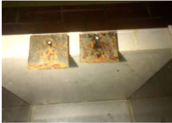
Figure1. shows the effect of UV on NaCl before cleaning

Figures 1 and 2 shows the effect of UV on NaCl before and after cleaning respectively. The result shows that the UV had an effect on the mild steel by reducing the corrosion.