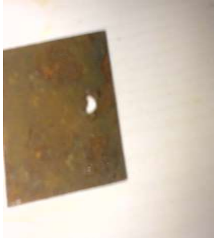
Figure 6 shows the effect of UV on NaCl after one week after cleaning