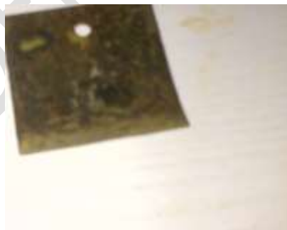
Figure 5 shows the effect of UV on NaCl after one week before cleaning

Figures 6 and 7 shows the effect of UV on HCl before cleaning and after cleaning respectively. The result shows that the UV had an effect on the coupons by reducing the corrosion.