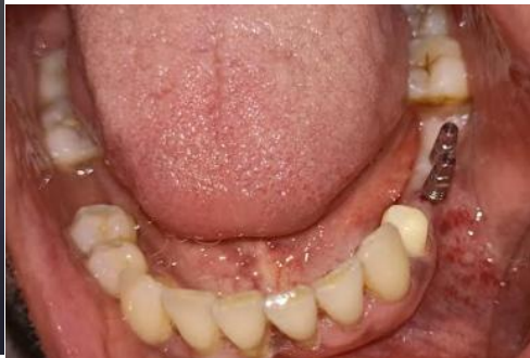
Figure 4: Intraoral picture of implants