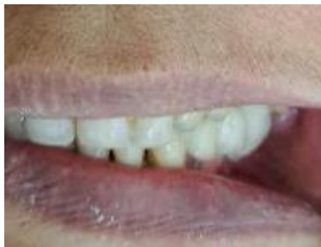
Figure 5: Final rehabilitation