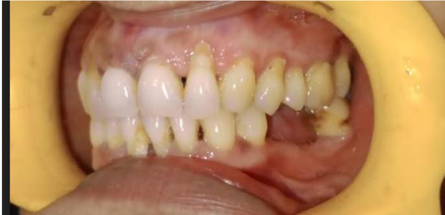
FIGURE 1: MISSING 35 AND 36

After CBCT evaluation and bone mapping an edentulous region was noted with no evidence of any remaining root fragment was noted, the alveolar bone revealed few bony trabeculae with large marrow spaces and intact cortical outlines along with Misch D2-D3 bone density. A dense sclerotic bony island was noted in the cervical-mid thirds of the alveolus wrt #36 region (figure 2).