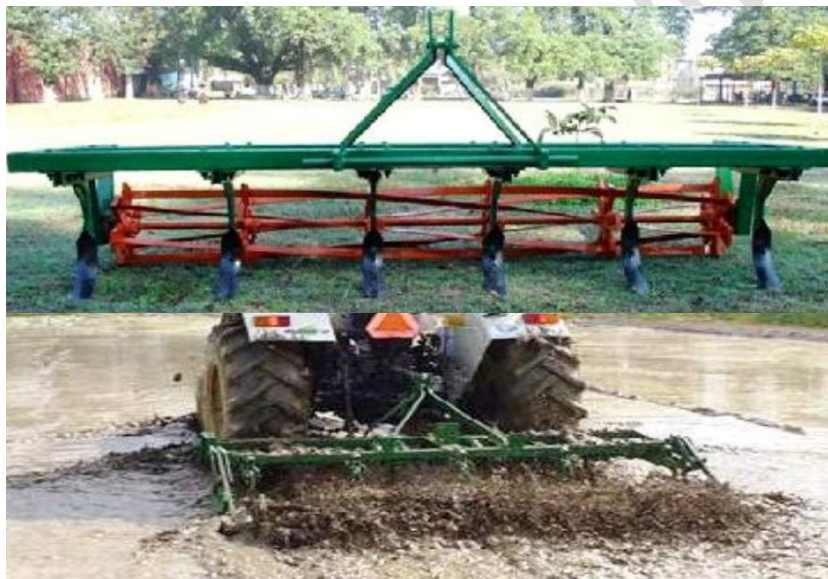
Fig.3: Pulverizing roller (Chhina, 2015)

beds. Comprising six pulverizing members crafted from MS steel flats, these members traverse through slots within star wheels. The attachment of the roller to the cultivator is facilitated by two links equipped with bearing housing on one end and tensile springs on the other. A rotavator is designed to efficiently prepare seedbeds in a single operation, accommodating both dry and wetland conditions. Its components typically include a frame, a rotary shaft equipped with blades, and a power transmission system connecting the gearbox to the shaft. The Tractor-Mounted Puddlers, similar to a rotavator but distinct in their design, tractor-mounted puddlers are equipped with less robust structures, featuring smaller drums and shoes. They tend to be wider than standard rotavators and can be operated in both wet and dry soil conditions, although they are most effective in fields with standing water. These puddlers are designed to leave the field surface level and yield optimal results when guided by laser technology (Chhina, 2015).