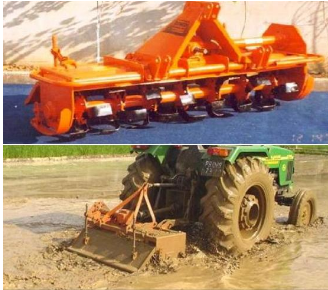
Fig.4 : Rotavator (Chhina, 2015)