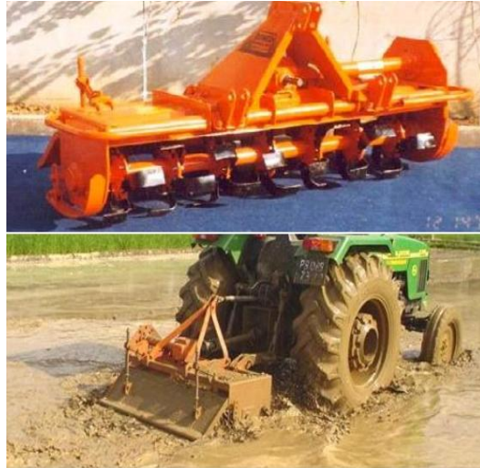
Fig.4 : Rotavator (Chhina, 2015)