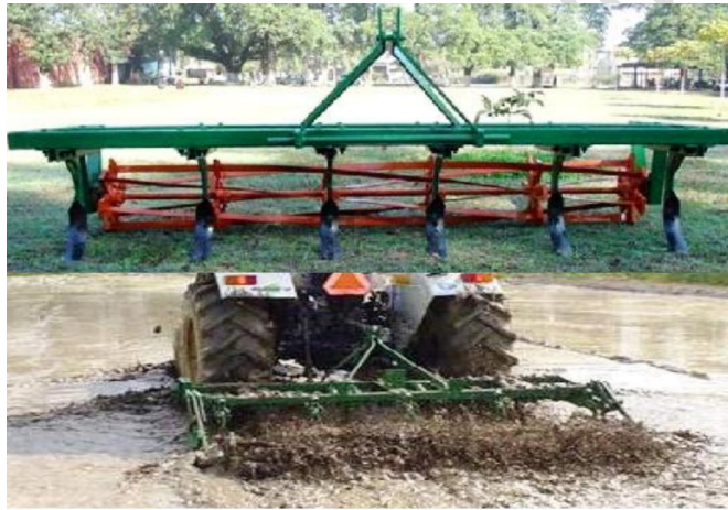
Fig.3: Pulverizing roller (Chhina, 2015)

beds. Comprising six pulverizing members crafted from MS steel flats, these members traverse through slots within star wheels. The attachment of the roller to the cultivator is facilitated by two links equipped with bearing housing on one end and tensile springs on the other. A rotavator is designed to efficiently prepare seedbeds in a single operation, accommodating both dry and wetland conditions. Its components typically include a frame, a rotary shaft equipped with blades, and a power transmission system connecting the gearbox to the shaft. The Tractor-Mounted Puddlers, similar to a rotavator but distinct in their design, tractor-mounted puddlers are equipped with less robust structures, featuring smaller drums and shoes. They tend to be wider than standard rotavators and can be operated in both wet and dry soil conditions, although they are most effective in fields with standing water. These puddlers are designed to leave the field surface level and yield optimal results when guided by laser technology (Chhina, 2015).