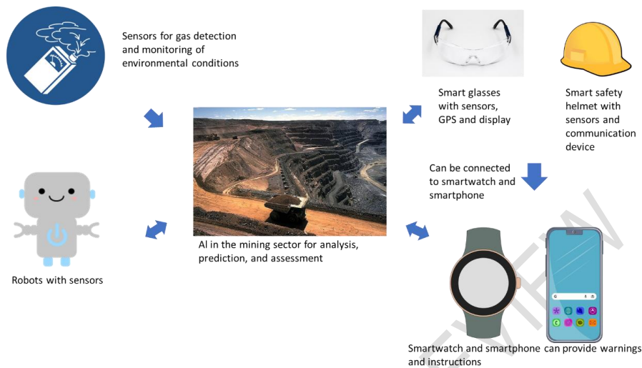
Fig. 2. Applications of AI in the mining sector